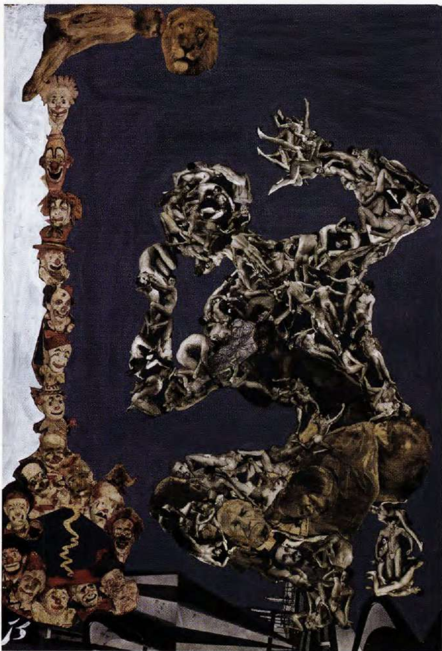
The Mouse's Tale , by Jess © The Jess Collins Trust, Berkeley, Calif. and San Francisco Museum of Modern Art, Calif. Gift of Frederic P. Snowden

What happens when an allusion goes unrecognized? A closer look at The Waste Land may help make this point. The body of Eliot's poem is a vertiginous mélange of quotation, allusion, and "original" writing. When Eliot alludes to Edmund Spenser's "Prothalamion" with the line "Sweet Thames, run softly, till I end my song," what of readers to whom the poem, never one of Spenser's most popular, is unfamiliar? (Indeed, the Spenser is now known largely because of Eliot's use of it.) Two responses are possible: grant the line to Eliot, or later discover the source and understand the line as plagiarism. Eliot evidenced no small anxi-